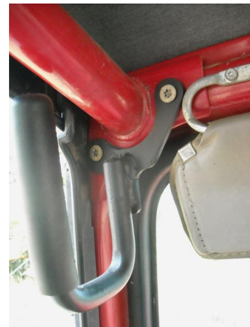
YJ shown in photos

Please visit our website at www.WelcomeDistributing.com "Like US" on Facebook at www.Facebook.com/Welcome.Distributing!