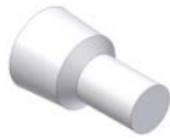
#10 Crimp cap