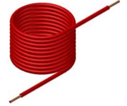
#5 Red Hot wire