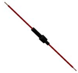
#7 Fuse holder