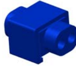
#9 Tap-in connector